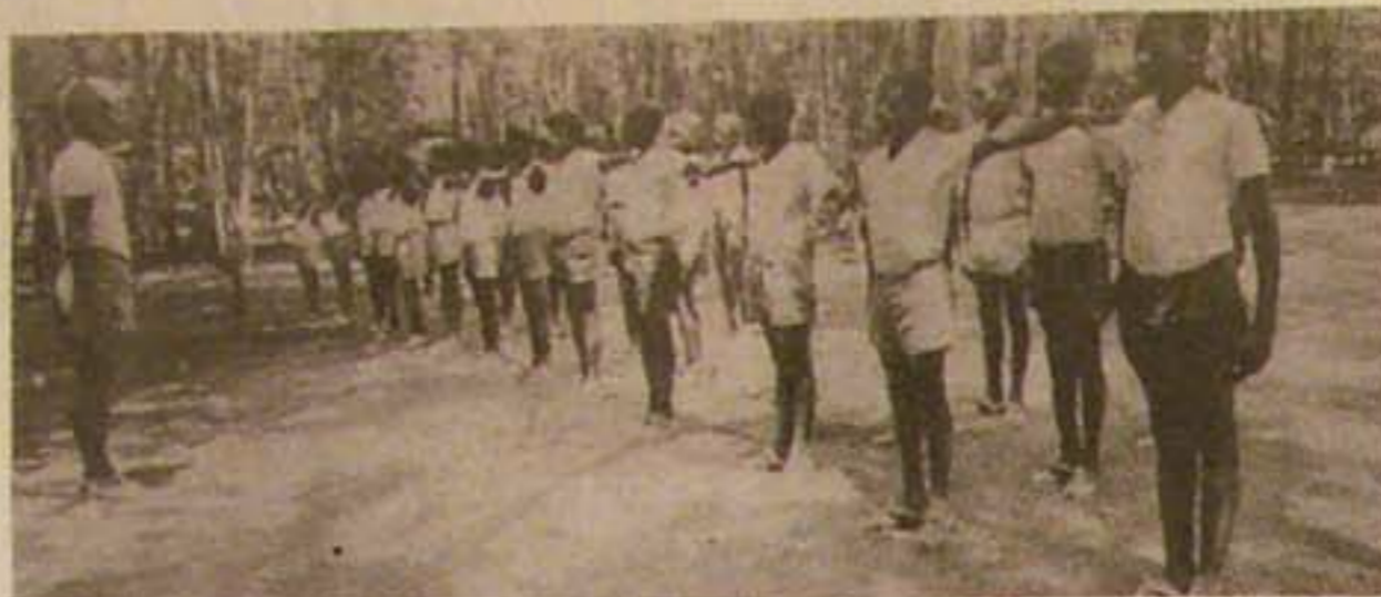
A physical fitness class in Guinea-Bissau.

"It is also time that the rest of the world took another serious look at the power of veto which has been abused several times by Britain, the United States and France. The power of veto which allows any of the five permanent members of the U.N. Security Council to prevent by its sole vote the taking of a decision which has the support of a majority of the Security Council members has outlived its usefulness. It is now absurd and contrary to the principles of the sovereignty and equality of all states. This power of veto must be abolished in the interests of all mankind, and to fit in with the times."