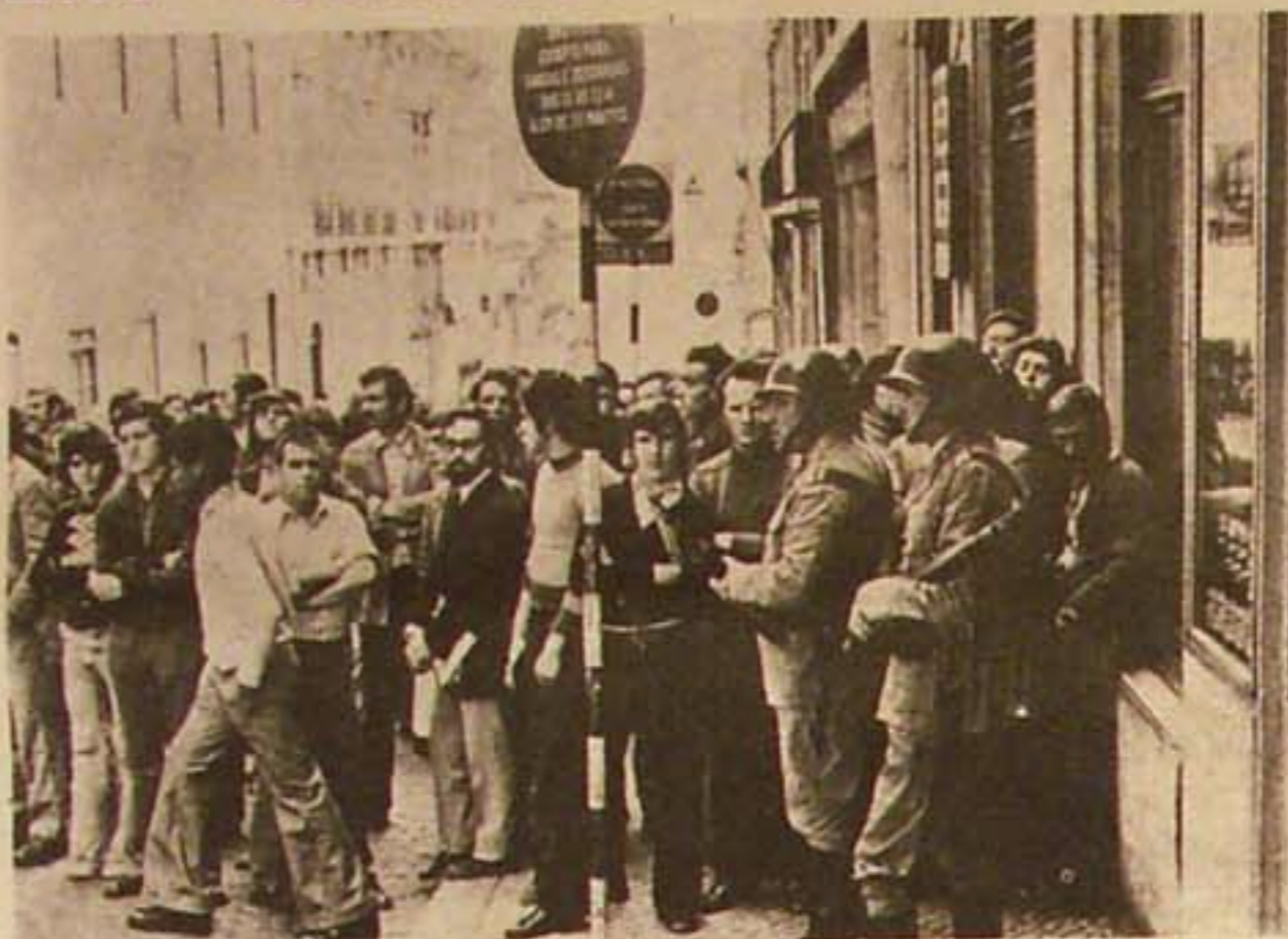
Young Portuguese under the watchful eye of the armed forces during the April 25, 1974, coup which removed fascist dictator Marcello Caetano and his regime.

The second wave of economic sabotage started during the political crisis in mid-July when