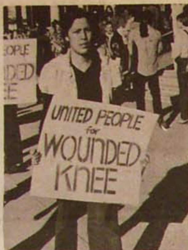
Indian woman demonstrator protesting illegal railroad of Wounded Knee defendants.

Also, last week, the joint Strategy and Action Committee (JSAC), a national organization of