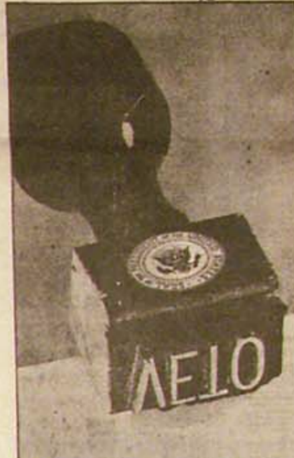
During his four months in office President FORD has had more veto confrontations with Congress than any President in this century.

In contrast to the billions Ford wants to deny social programs, he