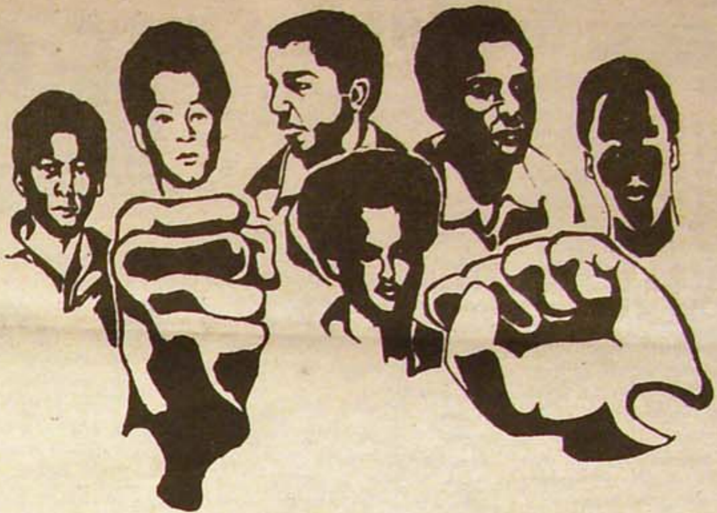
SAN QUENTIN SIX