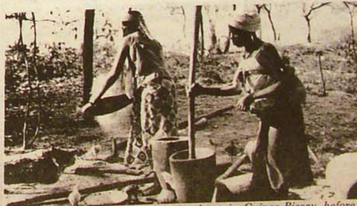
Two African women on the eastern front in Guinea-Bissau before liberation, preparing food for soldiers. One woman bears child on her back in traditional fashion.