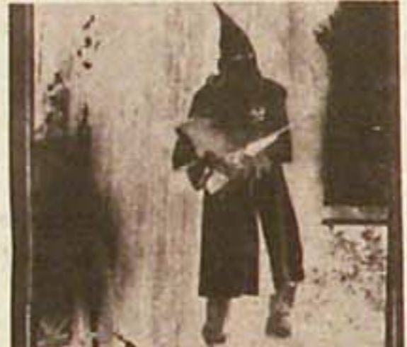
A member of the Klan.

It soon becomes apparent that if the liberals fail to side with the Klan, they will have to take up arms to defend themselves from the Klan.