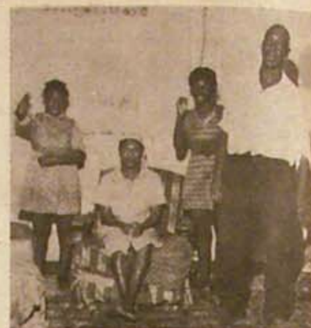
Third World women are the main victims of sterilization policies.

The victimized women are usually unaware of the wide range of alternative birth control methods available to them and that the operation is permanent with the chance of surgically