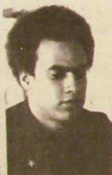
HUEY P. NEWTON