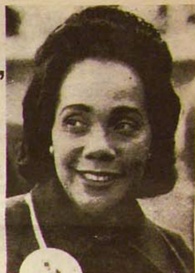
CORETTA SCOTT KING.

The Emergency Committee for a National Mobilization Against Racism said of the upcoming