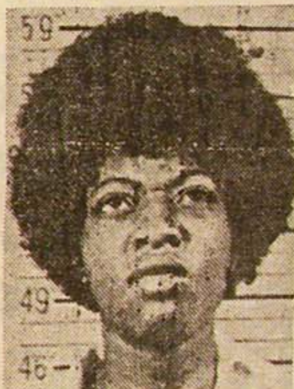
JOANNE LITTLE , charged with murder of White guard she said tried to rape her.