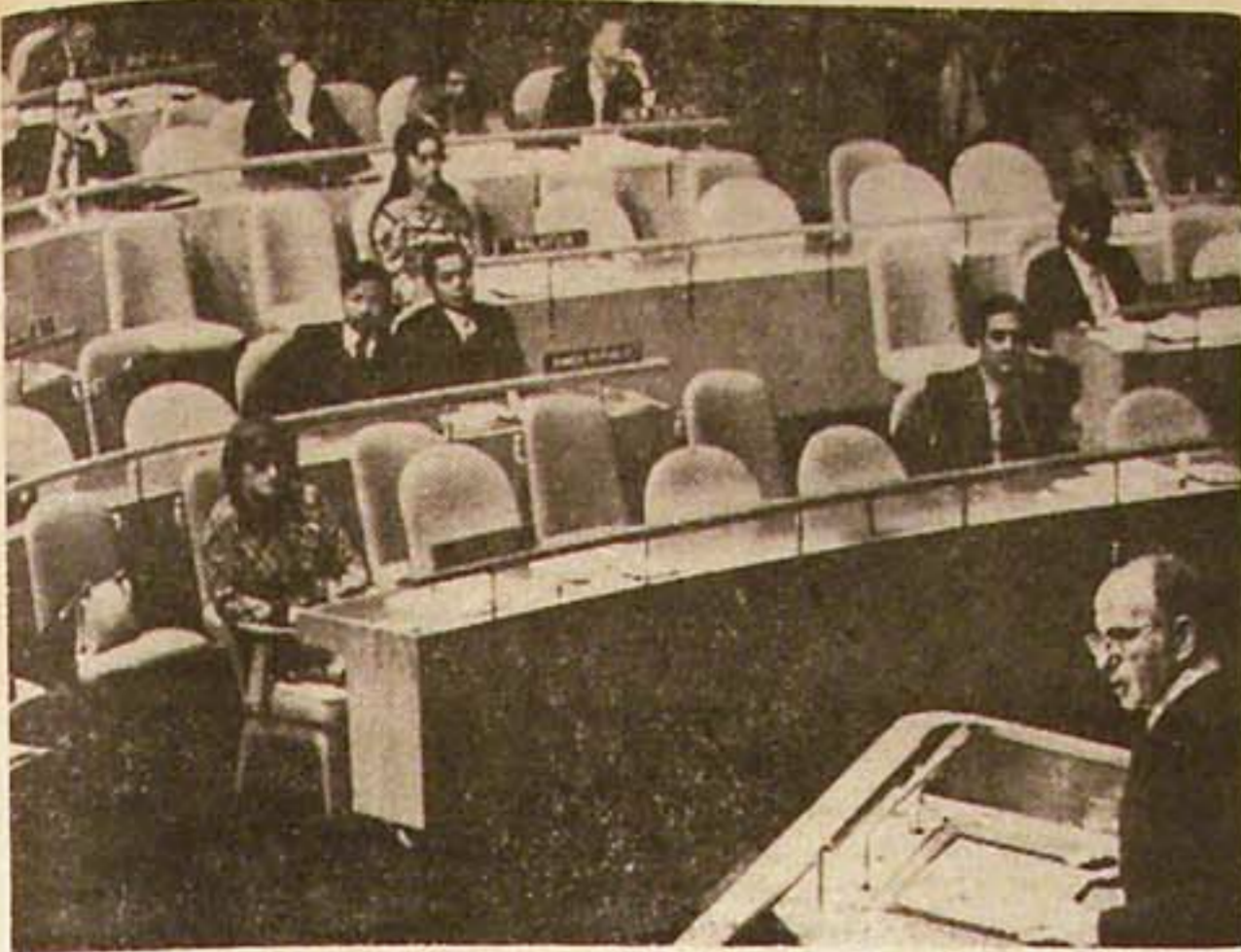
JOHN A. SCALI, U.S. delegate to the U.N., attacking the world body in the General Assembly. Notice the lack of attendance during his address.