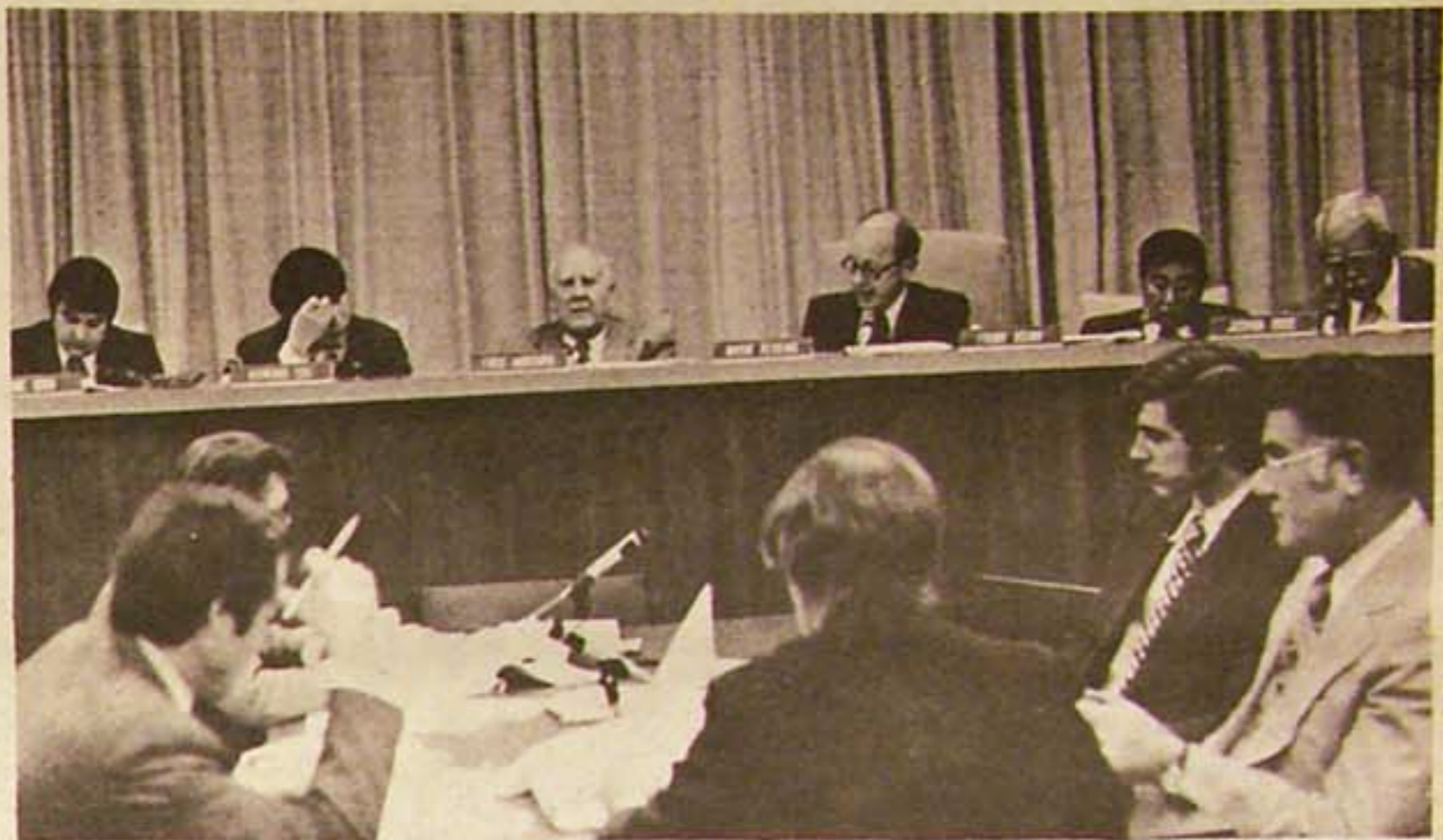
Oakland city councilmen and other city officials suggesting reorganization of city departments at the November 19 work session.

(Council and staff) have historically tended to avoid direct involvement in federal social-oriented programs. This lack of direct involvement has created serious impediments to responsive and effective government in Oakland."