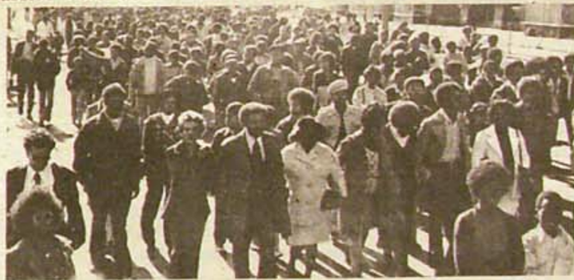
People marching in Boston in support of school desegregation.