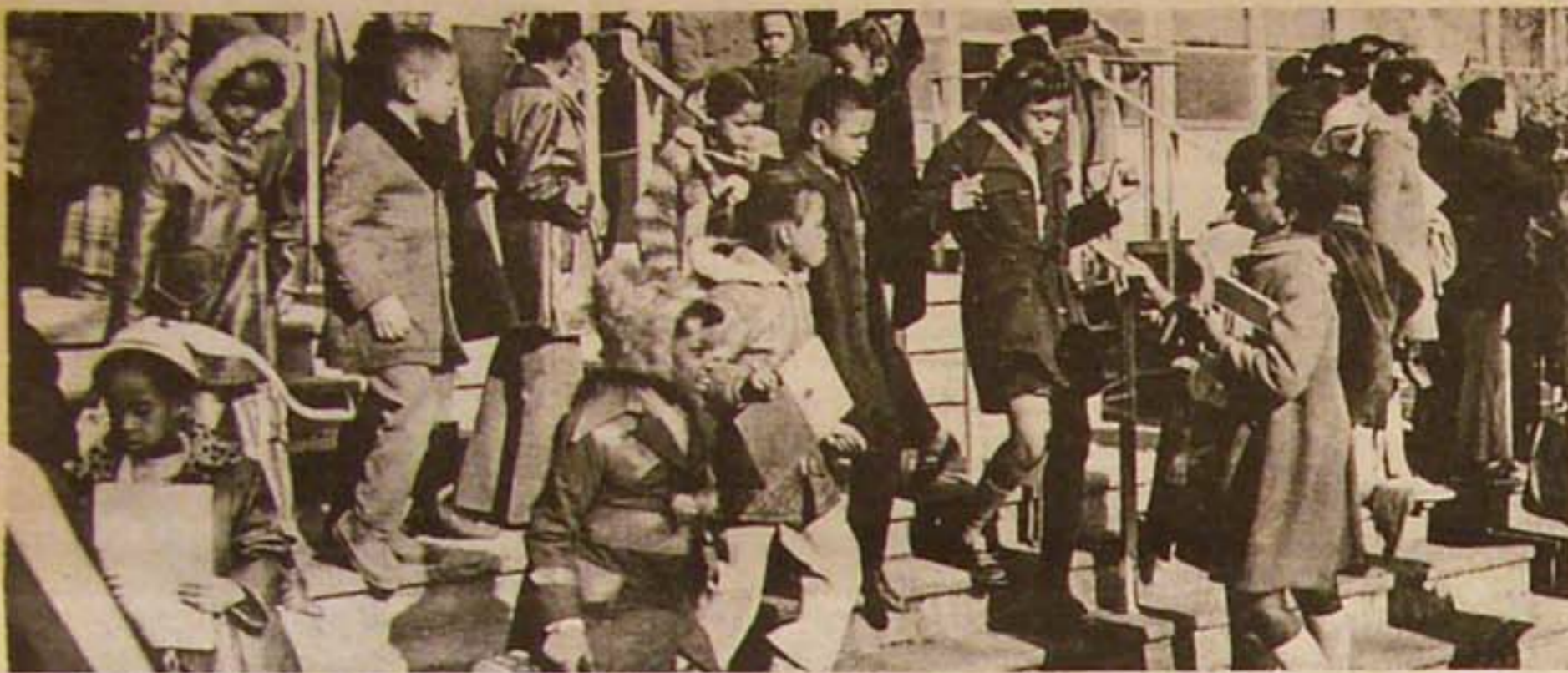
Black youth in public schools have had to take I.Q. tests which do not reflect their cultural background.