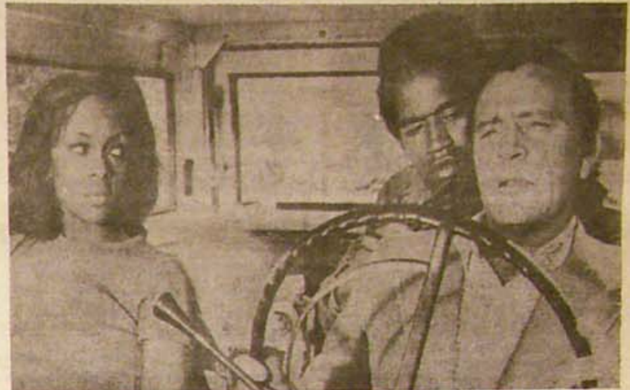
O.J. SIMPSON holds a gun on RICHARD BURTON while LOLA FALANA looks on.

The message is hatched out in several sub-plots which reveal much of the twisted psychology of the deep South. Rape, which seems to greatly occupy the minds of the poor racists in this small Alabama community, occurs three times in the film.