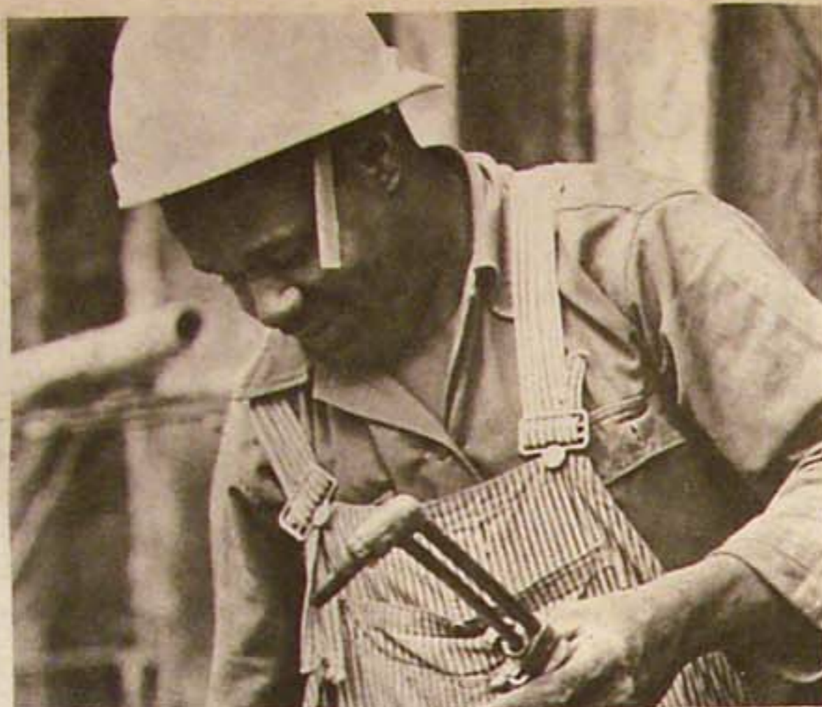
The Black worker—last hired, first fired—is the main victim of America's faltering economy.

Black women heading families have suffered nearly the same economic fate as Black men. In 1969 six per cent of Black female heads of families were unemployed, but by 1973, the figure rose to 13 per cent.